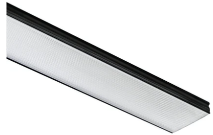
Metal cover. Suspension Up & Down. 70 mm (Colour Anodized Grey) 08.9057.02