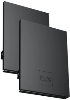
Metal cover. Suspension Up & Down. 70 mm (Colour Black) 08.9057.NS