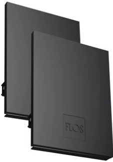
Metal cover. Suspension Up & Down. 70 mm 08.9057.06