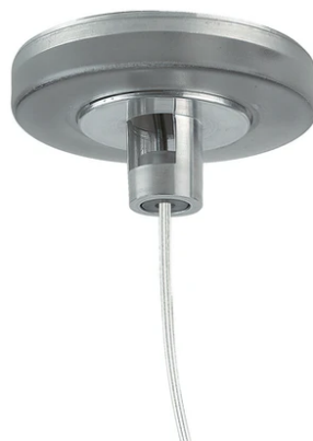
Power supply rose 08.0031.00