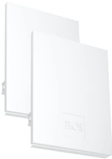
Metal cover. Suspension Up & Down. 70 mm 08.9057.06