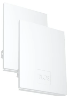
Metal cover. Suspension Up & Down. 70 mm (Colour Anodized Grey) 08.9057.02