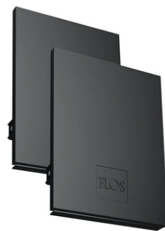
Metal cover. Suspension Up & Down. 70 mm 08.9057.06