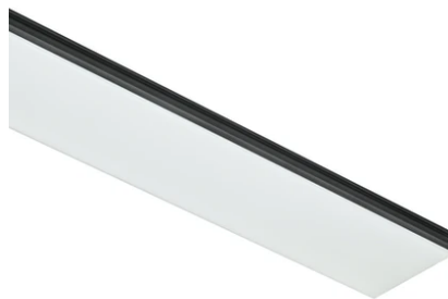
500 mm opal diffuser. Diffuse, glare free and uniform lighting throughout the room 08.0110.00