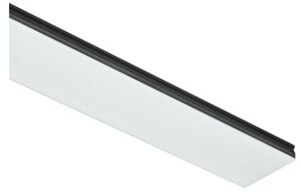
500 mm opal diffuser. Diffuse, glare free and uniform lighting throughout the room 08.0110.00