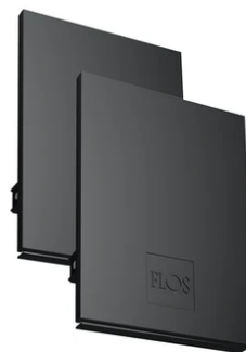
Metal cover. Suspension Up & Down. 70 mm (Colour White) 08.9057.40