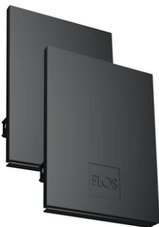
Metal cover. Suspension Up & Down. 70 mm 08.9057.06