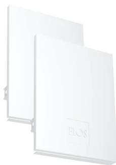
Metal cover. Suspension Up & Down. 70 mm (Colour Anodized Grey) 08.9057.02