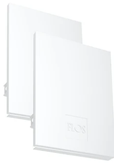
Metal cover. Suspension Up & Down. 70 mm (Colour Anodized Grey) 08.9057.02