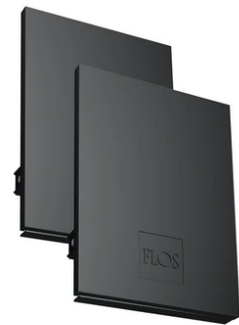
Metal cover. Suspension Up & Down. 70 mm 08.9057.06