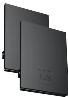
Metal cover. Suspension Up & Down. 70 mm 08.9057.06