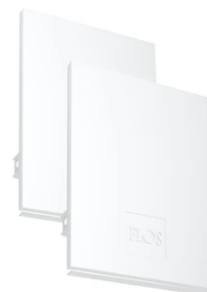
Metal cover. Suspension Up & Down. 70 mm (Colour Anodized Grey) 08.9057.02