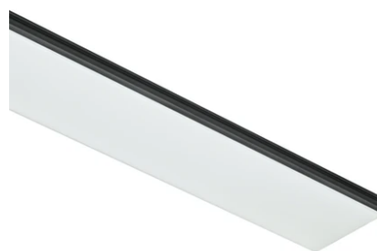
500 mm opal diffuser. Diffuse, glare free and uniform lighting throughout the room 08.0110.00