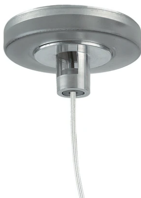
Power supply rose 08.0031.00