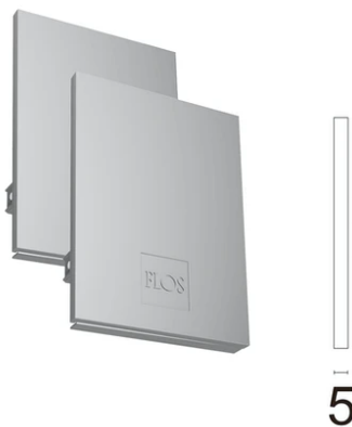
Metal cover. Suspension Up & Down. 70 mm (Colour Anodized Grey) 08.9057.02