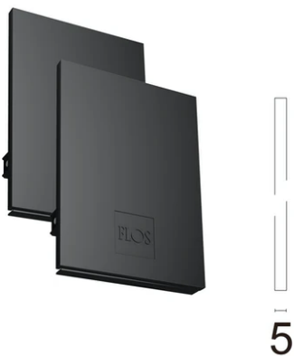
Metal cover. Suspension Up & Down. 70 mm 08.9057.06