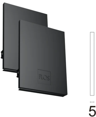
Metal cover. Suspension Up & Down. 70 mm (Colour Black) 08.9057.NS