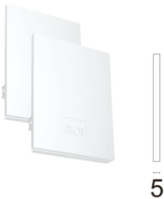
Metal cover. Suspension Up & Down. 70 mm (Colour White) 08.9057.40