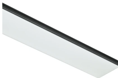
500 mm opal diffuser. Diffuse, glare free and uniform lighting throughout the room 08.0110.00