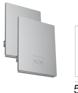
Metal cover. Suspension Up & Down. 70 mm (Colour Anodized Grey) 08.9057.02