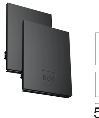
Metal cover. Suspension Up & Down. 70 mm 08.9057.06