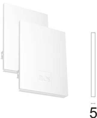
Metal cover. Suspension Up & Down. 70 mm (Colour White) 08.9057.40