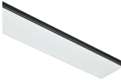
500 mm opal diffuser. Diffuse, glare free and uniform lighting throughout the room 08.0110.00