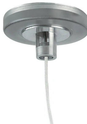
Power supply rose 08.0031.00