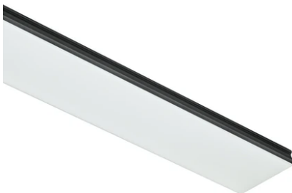
500 mm opal diffuser. Diffuse, glare free and uniform lighting throughout the room 08.0110.00