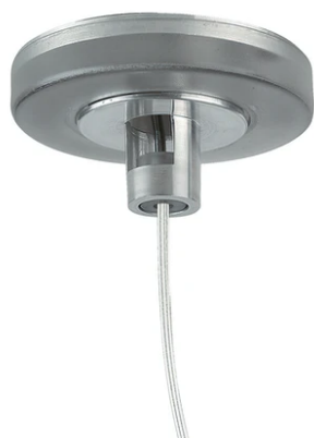
Power supply rose. Dali 08.0031.00.DA