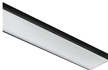
500 mm micro-prismatic diffuser. Highly efficient multilayer diffuser that, thanks to its unique microprismatic texture, provides a glare free UGR<19 light beam 08.0113.00