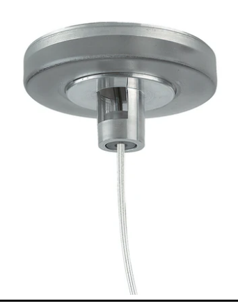
Metal cover. Suspension Up & Down. 70 mm (Colour Black) 08.9057.NS

Metal cover. Suspension Up & Down. 70 mm 08.9057.06