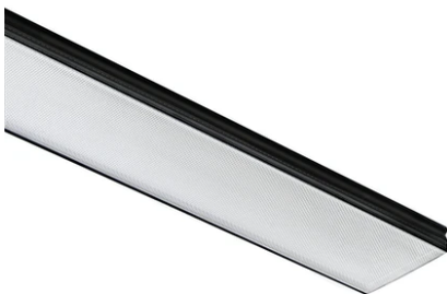
Metal cover. Suspension Up & Down. 70 mm 08.9057.06

500 mm micro-prismatic diffuser. Highly efficient multilayer diffuser that, thanks to its unique microprismatic texture, provides a glare free UGR<19 light beam