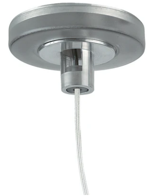
Power supply rose 08.0031.00