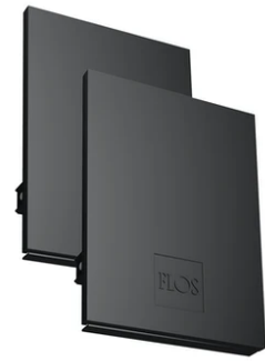
Metal cover. Suspension Up & Down. 70 mm (Colour Black) 08.9057.NS