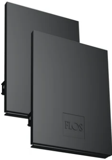
Metal cover. Suspension Up & Down. 70 mm 08.9057.06