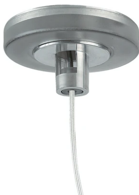
Power supply rose. Dali 08.0031.00.DA