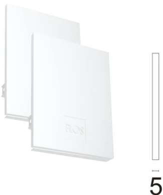
Metal cover. Suspension Up & Down. 70 mm (Colour White) 08.9057.40