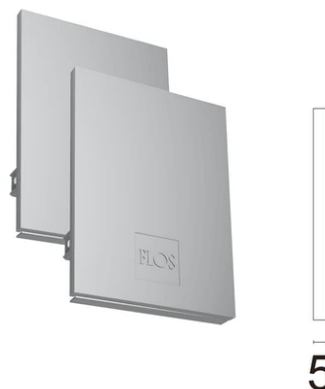
Metal cover. Suspension Up & Down. 70 mm (Colour Anodized Grey) 08.9057.02