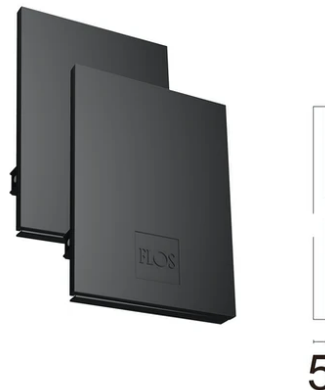
Metal cover. Suspension Up & Down. 70 mm 08.9057.06