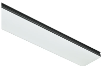
500 mm opal diffuser. Diffuse, glare free and uniform lighting throughout the room 08.0110.00