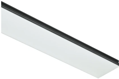
500 mm opal diffuser. Diffuse, glare free and uniform lighting throughout the room 08.0110.00