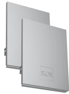
Metal cover. Suspension Up & Down. 70 mm 08.9057.06