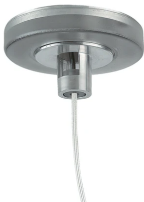
Power supply rose. Dali 08.0031.00.DA