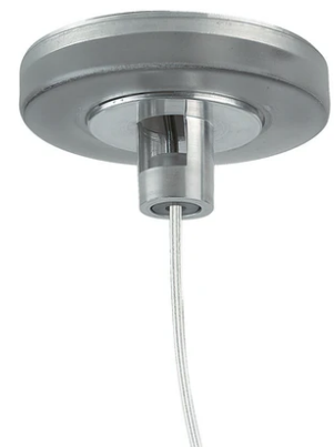
Power supply rose. Dali 08.0031.00.DA