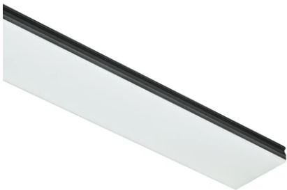
500 mm opal diffuser. Diffuse, glare free and uniform lighting throughout the room 08.0110.00