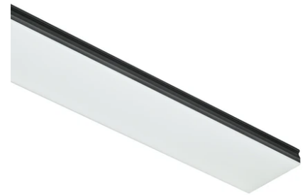
500 mm opal diffuser. Diffuse, glare free and uniform lighting throughout the room 08.0110.00