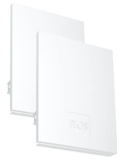
Metal cover. Suspension Up & Down. 70 mm 08.9057.06