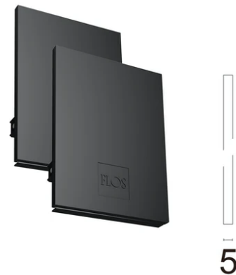
Metal cover. Suspension Up & Down. 70 mm 08.9057.06