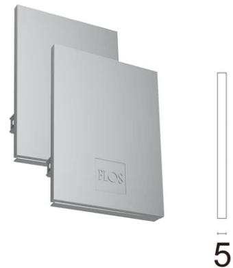
Metal cover. Suspension Up & Down. 70 mm (Colour Anodized Grey) 08.9057.02