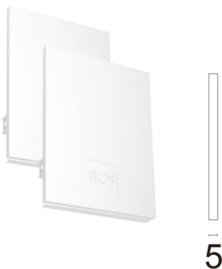
Metal cover. Suspension Up & Down. 70 mm (Colour White) 08.9057.40