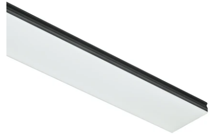
500 mm opal diffuser. Diffuse, glare free and uniform lighting throughout the room 08.0110.00