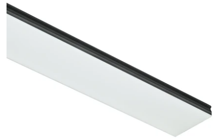
500 mm opal diffuser. Diffuse, glare free and uniform lighting throughout the room 08.0110.00