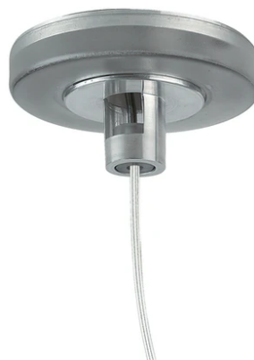
Power supply rose 08.0031.00