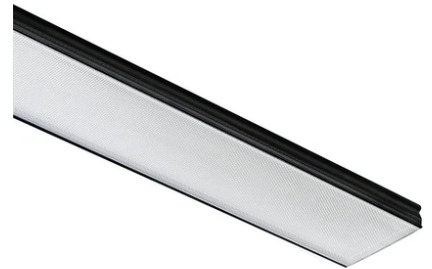
Metal End Cap. Recessed No Trim / Surface / Suspension Down. 70 mm (Colour Anodized Grey) 08.9052.02