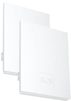
500 mm micro-prismatic diffuser. Highly efficient multilayer diffuser that, thanks to its unique microprismatic texture, provides a glare free UGR<19 light beam 08.0113.00