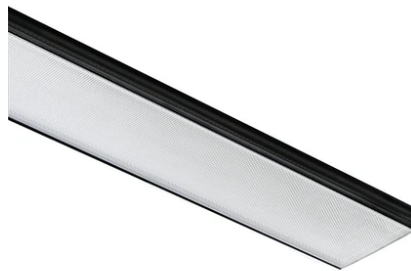
500 mm micro-prismatic diffuser. Highly efficient multilayer diffuser that, thanks to its unique microprismatic texture, provides a glare free UGR<19 light beam 08.0113.00