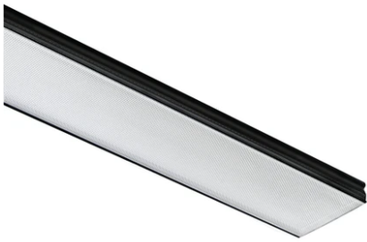
500 mm micro-prismatic diffuser. Highly efficient multilayer diffuser that, thanks to its unique microprismatic texture, provides a glare free UGR<19 light beam 08.0113.00