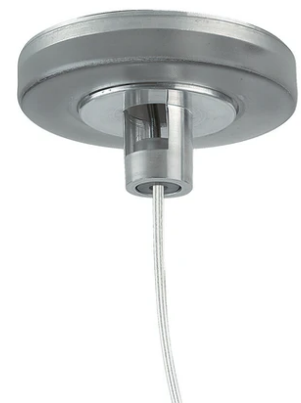
Power supply rose 08.0031.00