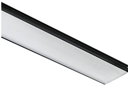
500 mm micro-prismatic diffuser. Highly efficient multilayer diffuser that, thanks to its unique microprismatic texture, provides a glare free UGR<19 light beam 08.0113.00