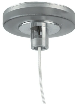
Power supply rose. Dali 08.0031.00.DA