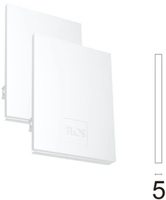
Metal End Cap. Recessed No Trim / Surface / Suspension Down. 70 mm (Colour White) 08.9052.40