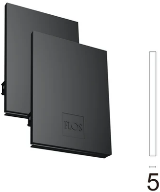
Metal End Cap. Recessed No Trim / Surface / Suspension Down. 70 mm (Colour Black) 08.9052.03