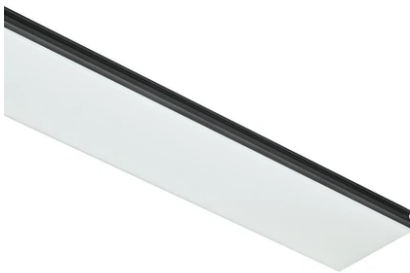
500 mm opal diffuser. Diffuse, glare free and uniform lighting throughout the room 08.0110.00