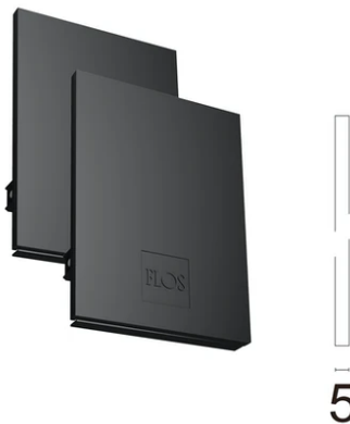
Metal cover. Surface / Suspension Down. 70 mm 08.9052.06