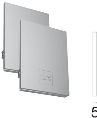
Metal End Cap. Recessed No Trim / Surface / Suspension Down. 70 mm (Colour Anodized Grey) 08.9052.02