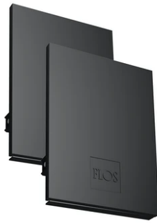
Metal End Cap. Recessed No Trim / Surface / Suspension Down. 70 mm (Colour Anodized Grey) 08.9052.02