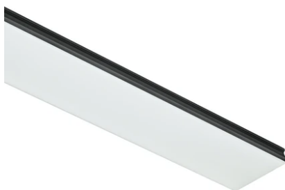
Metal cover. Surface / Suspension Down. 70 mm 08.9052.06

500 mm opal diffuser. Diffuse, glare free and uniform lighting throughout the room