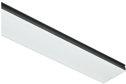
500 mm opal diffuser. Diffuse, glare free and uniform lighting throughout the room 08.0110.00