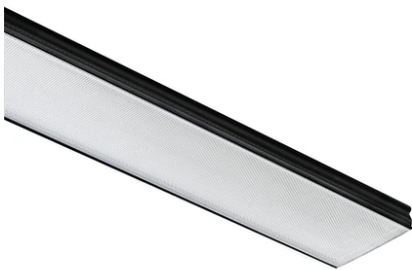
500 mm micro-prismatic diffuser. Highly efficient multilayer diffuser that, thanks to its unique microprismatic texture, provides a glare free UGR<19 light beam 08.0113.00