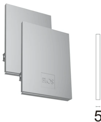
Metal End Cap. Recessed No Trim / Surface / Suspension Down. 70 mm (Colour Anodized Grey) 08.9052.02