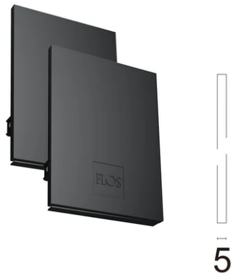
Metal cover. Surface / Suspension Down. 70 mm 08.9052.06