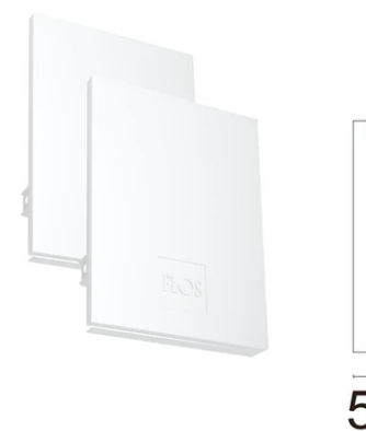
Metal End Cap. Recessed No Trim / Surface / Suspension Down. 70 mm (Colour White) 08.9052.40