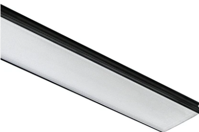
500 mm micro-prismatic diffuser. Highly efficient multilayer diffuser that, thanks to its unique microprismatic texture, provides a glare free UGR<19 light beam 08.0113.00