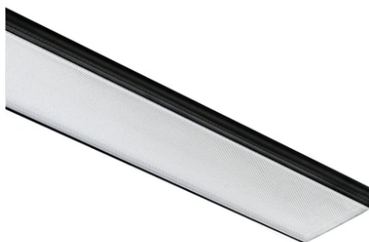
500 mm micro-prismatic diffuser. Highly efficient multilayer diffuser that, thanks to its unique microprismatic texture, provides a glare free UGR<19 light beam 08.0113.00