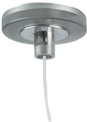
Power supply rose 08.0031.00