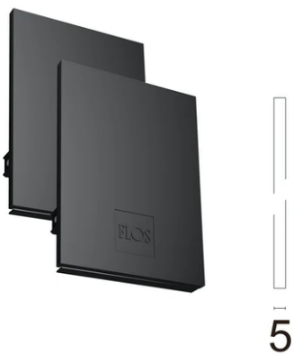
Metal cover. Surface / Suspension Down. 70 mm 08.9052.06