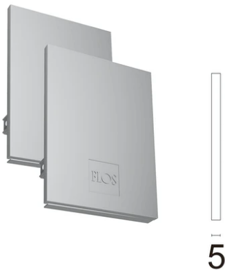
Metal End Cap. Recessed No Trim / Surface / Suspension Down. 70 mm (Colour Anodized Grey) 08.9052.02