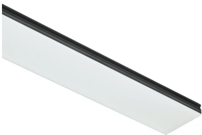
500 mm opal diffuser. Diffuse, glare free and uniform lighting throughout the room 08.0110.00