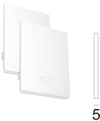
Metal End Cap. Recessed No Trim / Surface / Suspension Down. 70 mm (Colour White) 08.9052.40