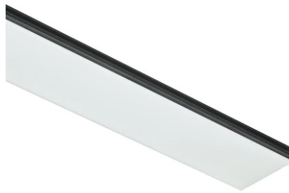
500 mm opal diffuser. Diffuse, glare free and uniform lighting throughout the room 08.0110.00