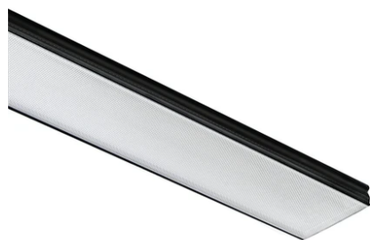
500 mm micro-prismatic diffuser. Highly efficient multilayer diffuser that, thanks to its unique microprismatic texture, provides a glare free UGR<19 light beam 08.0113.00