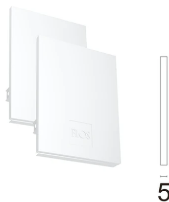
Metal End Cap. Recessed No Trim / Surface / Suspension Down. 70 mm (Colour White) 08.9052.40