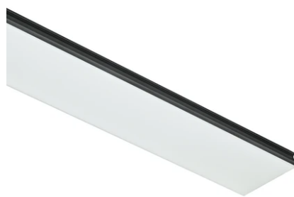
500 mm opal diffuser. Diffuse, glare free and uniform lighting throughout the room 08.0110.00