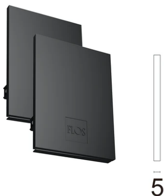
Metal End Cap. Recessed No Trim / Surface / Suspension Down. 70 mm (Colour Black) 08.9052.NS