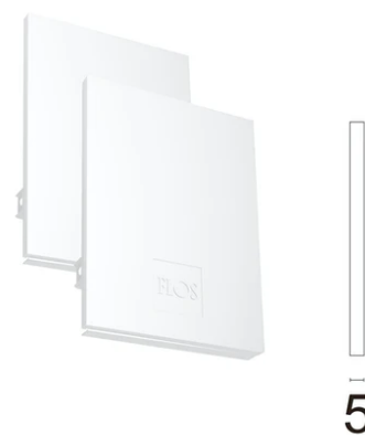
Metal End Cap. Recessed No Trim / Surface / Suspension Down. 70 mm (Colour White) 08.9052.40