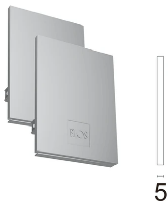
Metal End Cap. Recessed No Trim / Surface / Suspension Down. 70 mm (Colour Anodized Grey) 08.9052.02