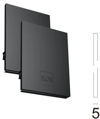
Metal cover. Surface / Suspension Down. 70 mm 08.9052.06