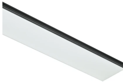
Metal End Cap. Recessed No Trim / Surface / Suspension Down. 70 mm (Colour White) 08.9052.40