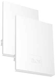
Metal End Cap. Recessed No Trim / Surface / Suspension Down. 70 mm (Colour Anodized Grey) 08.9052.02