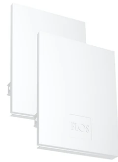
Metal End Cap. Recessed No Trim / Surface / Suspension Down. 70 mm (Colour Anodized Grey) 08.9052.02