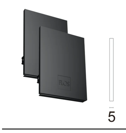
Metal cover. Recessed Trim. 70 mm (Colour Black) 08.9053.NS