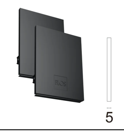
Metal cover. Recessed Trim. 70 mm (Colour Black) 08.9053.NS