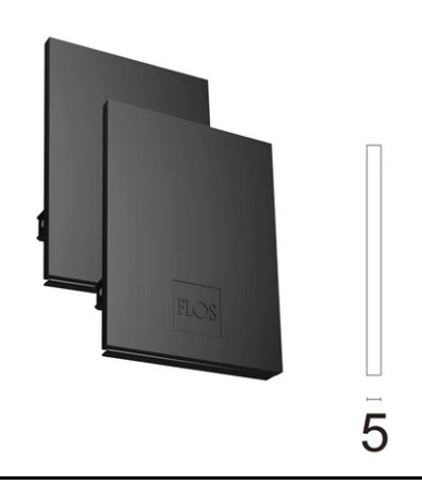
Metal cover. Recessed Trim. 70 mm (Colour Black) 08.9053.NS